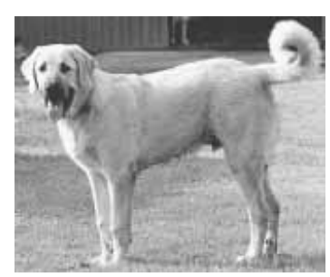
Descended from Asian shepherd dogs, "Oklahoma Farm Dogs" make great guard dogs, according to Zahorsky.

Contact: FARM SHOW Followup, Pril Zahorsky, R.R. 1, Box 37A, Dacoma, Okla. 73731 (ph 405 871-2439).