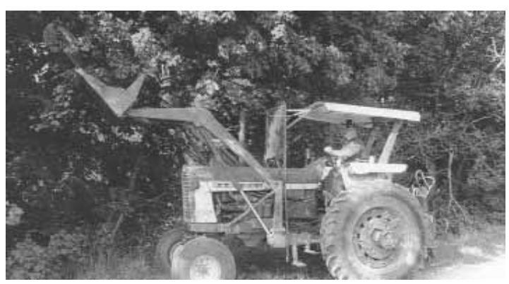
Hydraulic powered brushcutter saws through 3 to 4-in. dia. branches with ease, Brook says.

Contact: FARM SHOW Followup, Roman Welding & Machinery Co., 1714 Independence Blvd., Sarasota, Fla. 34234 (ph 800 844-5540 or 941 355-8046; fax 941 351-5236).