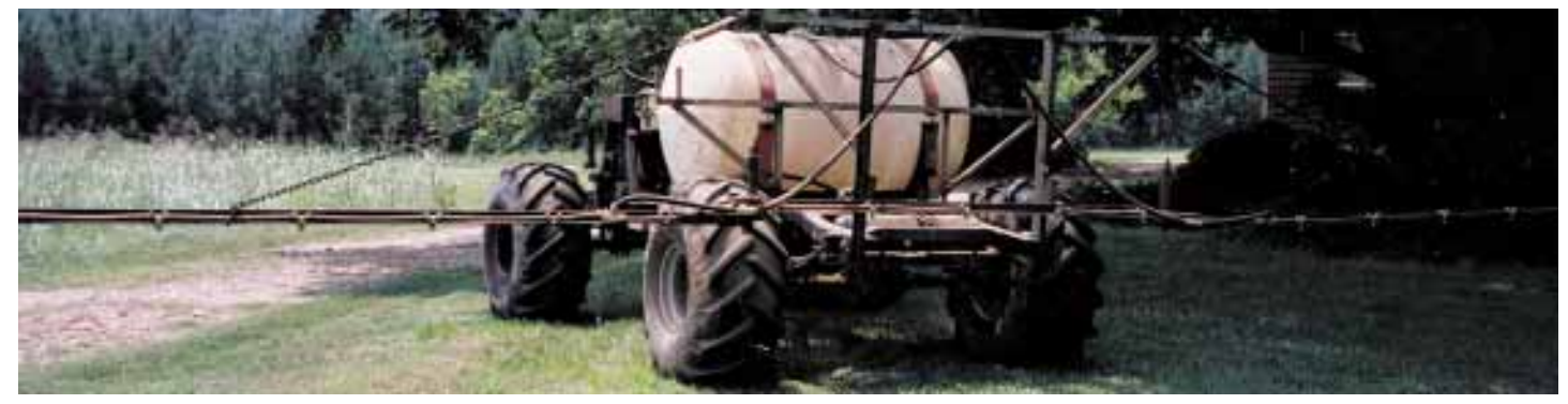
The 4-WD pickup was stripped down as much as possible to save weight and rides on 18.4 by 16 flotation tires, allowing it to float on top of ground without leaving deep tracks.