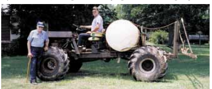
Minick used 3-in. channel iron to build a frame that supports a 300-gal. spray tank behind the seat.

Contact: FARM SHOW Followup, Delmas Manufacturing Ltd., Box 500, Delmas, Sask. Canada SOM OPO (ph 306 445-5562; fax 9842).