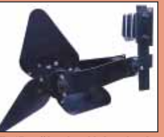
The "Prop" has three blades splayed out at a 45 degree angle from the hub. They dig little water-catching dams as they work through the soil behind ripper. 1 1/4 by 8-in. shanks.

Different size shims allow installation on 1 by 3-in., 1 by 4-in., 1 1/4 by 7-in. and