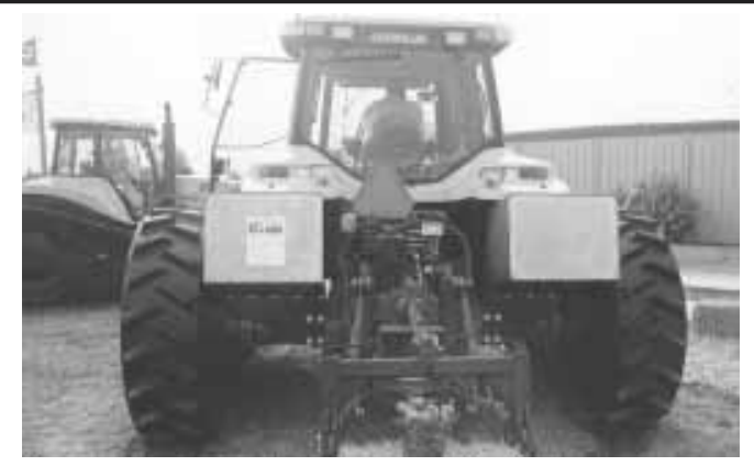
Stainless steel chemical tanks hold 440, 500, or 600 gals. depending on model.