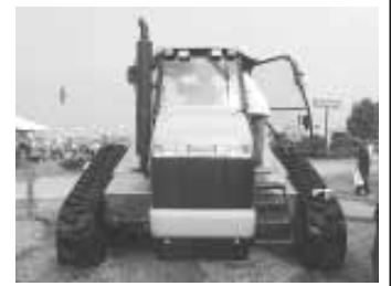
Tanks bolt to support pipe that spans the

Contact: FARM SHOW Follouwp, Modern Metalcraft, Inc., 1257 E. Wackerly, Midland, Mich. 48642 (ph 800 948-3182).