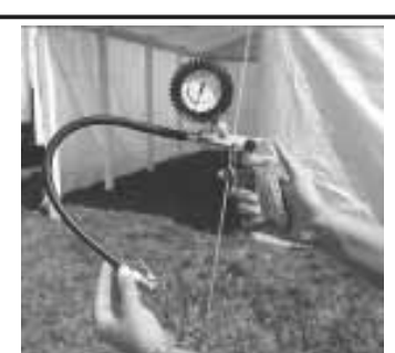
Gun's in-line pressure gauge lets you add, remove air without unhooking.

sure Washer Shop, Ltd., R.R. N 1, Elmira, Ontario, Canada N3B 2Z1 (ph 519 669-2150).