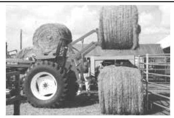
Maximum lift height of the 3-pt. bale spear is 9 1/2 ft., enough to stack bales 3 high.