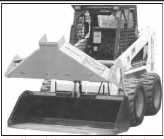
Adjustable spout hooks into existing bucket with three pins.

Contact: FARM SHOW Followup, Derald Madden, Marshall, Minn.