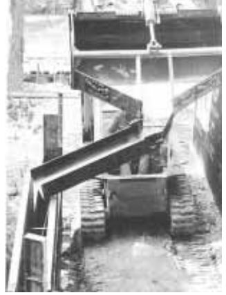
A 36-in. removable extension can be added for increased reach.

Contact: FARM SHOW Followup, Jo-Da-Ly Attachments Inc., Rt. 1, Box 34 BB, Rose-