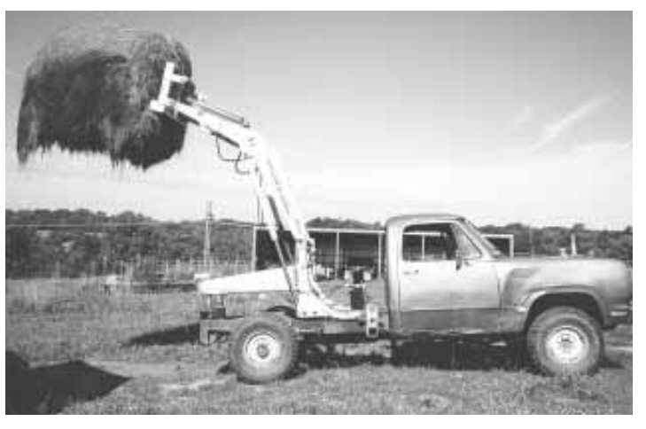
Morrison cut the box off a 1975 Dodge 4-WD pickup and welded a front-end loader onto the frame. He uses loader to spear round bales and load them onto a trailer.

bud, Mo. 63901 (ph 888 563-2591 or 573-764-5099; fax 3487).