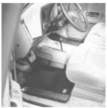
Custom-molded front floor liners have 2 1/2-in. high "lips" at the edges that contain spills and help protect carpeted areas from water, snow, and mud.

Contact: FARM SHOW Followup, Winfield Consumer Products, Inc., Box 839,