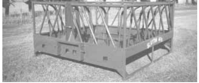
Bale feeder is equipped with a rear gate that swings open for easy loading.

Contact: FARM SHOW Followup, Leroy Stumpe, 25878 Westmark Ave., Hartford, S. Dak. 57033 (ph 605 528-6798).