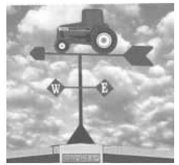
All-metal weather vane bolts onto roof and is 38 in. high and 38 in. long.

Contact: FARM SHOW Followup, Distel Grain Systems, Inc., Box 108, Le Sueur, Minn. 56058 (ph 507 665-6776 or 800 426-1848).