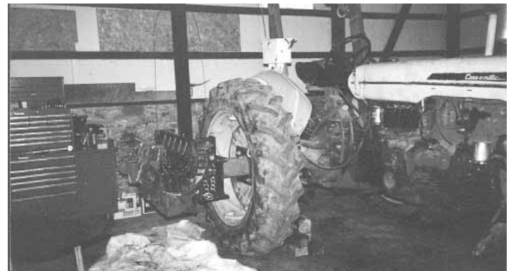
Engine stand allows the Staats to rotate an engine as needed when working on it.

Another method for protecting cropland is to erect a series of tall poles and train the falcons to fly from pole to pole. As they make the circuit, pest birds all along the route are scared away. (Excerpted from Capital Press)