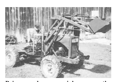
Prince used commercial arms on the loader, which is equipped with a rearmounted winch.

He mounted a 1,500-lb. winch equipped with 30 ft. of cable on the rear to use for skidding logs. It runs off a pto shaft out of the transmission.