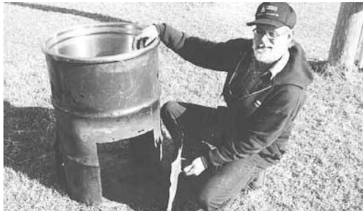
Built out of a 55-gal. drum, Smith's chili cooker can feed 100.