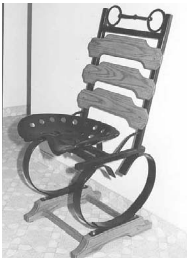
Bonnett's rocker rides on spring-type harrow shanks and is fitted with a horse bit back rest on top.

Contact: FARM SHOW Followup, Leslie Bonnett, Box 504, Gravelbourg, Sask., Canada S0H 1X0 (ph 306 648-2815).