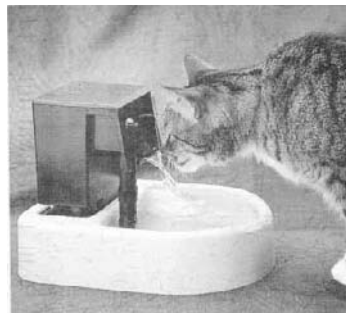
Water is delivered via an electric pump.

Contact: FARM SHOW Followup, Veterinary Ventures, 844 Bell St., Reno, Nev. 89503