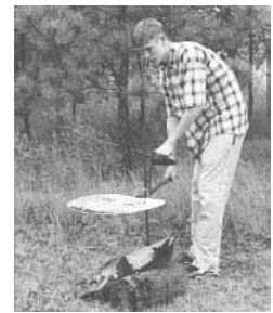
New-style camp grill sets up in only about 10 seconds.

Contact: FARM SHOW Followup, Derek Kruckman, W. 8945 759th Ave., River Falls, Wis. 54022 (ph 715 426-1314).