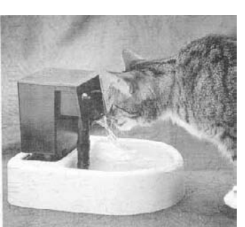
Water is delivered via an electric pump.

(ph 800 805-7532 or 702 322-5220; fax 2530).