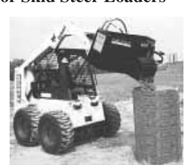
"Mud Bucket" lets one person accurately place concrete into forms with no need to

Contact: FARM SHOW Followup, McMillen Construction Equipment Attachments, 4419 Ardmore Ave., Fort Wayne, Ind. 46809 (ph 800 234-0964; fax 219 747-9161).