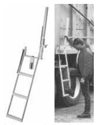
Ladder comes with 36-in. high grab handle. Steps flip up and latch to handle when not in use.

Contact: FARM SHOW Followup, Knapheide Truck Equipment Co., 1920 E. Front St., Kansas City, Mo. 64120 (ph 816 472-4444).