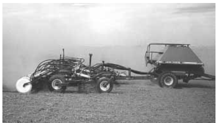
New 36-ft, wide air seeder features a 3-section frame that flexes on even the hilliest ground.