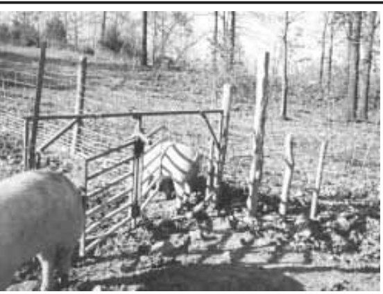
Hemple's gate is made as a single unit that fits in a 6-ft. opening.

Contact: FARM SHOW Followup, Matthew Hempel, Semper Fidelis Ranch, Rt. 1, Box 52, Eldridge, Mo. 65463.