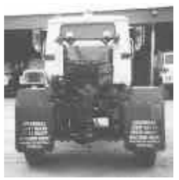
Hydraulic operated hitch and 20,000-lb. winch mount on back.

"We also use it in winter to plow snow. We can mount a blade on back of the truck as well as on front so we can push and pull. Both blades are raised or lowered by a hydraulic cylinder attached to the blade mounting bracket. Power is supplied by a hydraulic pump that mounts under the hood, controlled by a toggle switch in the cab. The rear blade works great for removing snow