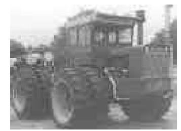
Designed to run on gas, jet fuel and diesel, the engine is comparable in horsepower to White's 2-155, the Evels note.

"We're very happy with it," says Jim. "We use it as our main tillage tractor. We figured that buying a used tractor and military engine was the least expensive way to get a tractor with the horsepower we needed. Our total cost was only about $5,000. We got a good deal on the engine - a military