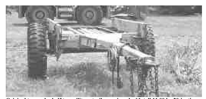
Original two and a-half ton military trailer equipped with tall 11.00 by 20-in. tires.