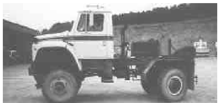
A pair of 2 1/2-ton steering axles from old Army trucks provide 4-wheel steering. 4-WD, 4-Wheel Steer "Utility Truck"

Contact: FARM SHOW Followup, Vernon Evel, RR 1, Utica, Kan. 67584 (ph 913 391-2428).