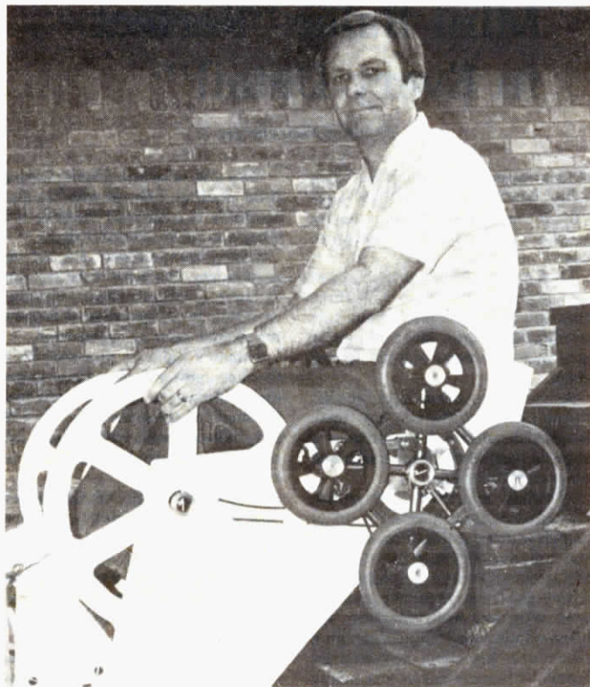
As 4-wheeled "spider wheel" walks up steps, chair drops from normal riding position to an angle that keeps the rider upright as the chair climbs the steps.

For more information, contact: FARM SHOW Followup, Ken Cox, Stair Master Wheel Chair Co., 2711 Marquis Circle East, Arlington, Tex. 76016 (ph 817 496-3080).