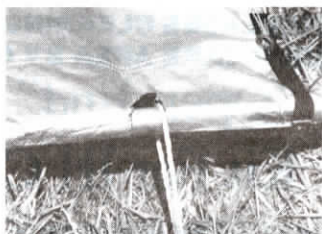
Company says its new tie-down system works better than grommets.

A 25 by 35 ft. tarp covers 54 5-by-4 bales (stacked in a 3-2-1 pyramid) and retails for $269 (U.S.). A 20 by 36 tarp covers 54 4-