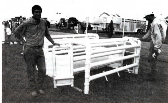
Crates are built from 2 and 3-in. PVC pipe. Water lines run through pipe to nipple waterer built into one leg of crate and a wet-type sow feeder on front gate.

For more information, contact: FARM SHOW Followup, Tri-R Innovations, 628 S. Sangamon, Gibson City, Ill. 60936 (ph 217 784-8495).