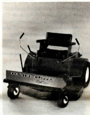
Low, wide body of Country Clipper makes it ideal for slopes.

The mower deck is made of heavy-gauge steel reinforced with 3/8-in. steel bar frame. All decks have three blades with a minimum 1 1/2 in. overlap to cut smoother and eliminate windrowing.