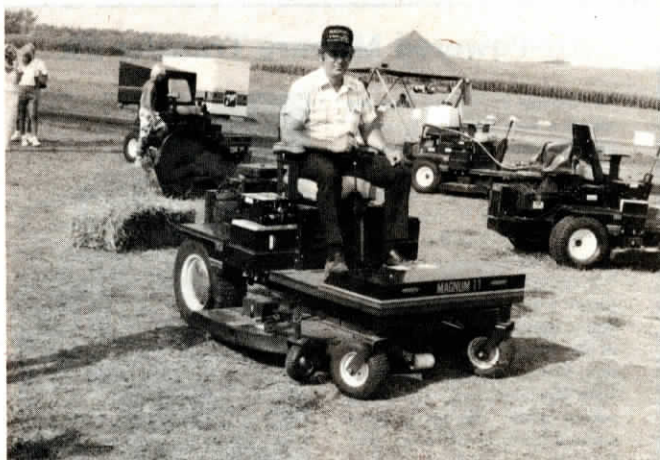
Controlled by a single "joystick", heavy-built Schweiss mower "turns in its tracks" for close-in trimming.

Contact: FARM SHOW Followup, Schweiss, Inc., Co. Rd. 13, P.O. Box 557, Sherburn, Minn. 56171 (ph 507 764-2251).