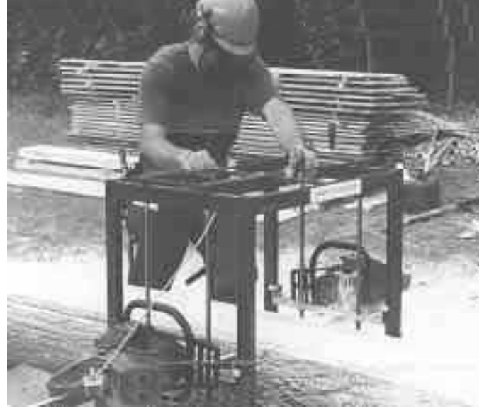
Sawmill's 22-in. wide carriage is equipped with a single chain saw-type cutterbar powered by a chainsaw power unit mounted on either end.