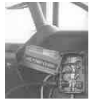
Box allows six different accessories to be wired together.

"The outlet box can even be used to power most electric-powered pumps and compressors on sprayers. It's available with a 3-pole convenience outlet that matches the factory outlets on 1993 and newer Deere,