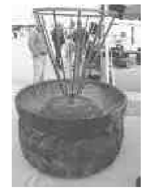
The 3-ft. dia. basket holds one small square bale.

He also uses old tires to make stock tanks that range from 5 to 12 ft. in diameter and sell for $200 to $550. And he uses big industrial-size rubber tires to make 3-pt. tire scrapers that range from 5 to 10 ft. wide. Mounts are available to fit skid-steer buck-