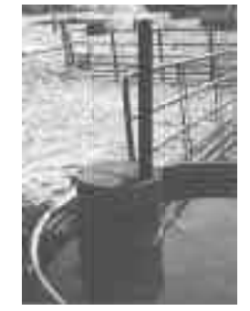
Wood-fired tank heaters keep 600 gal. of water open and warm.

to the bottom of the stock tank so you don't have to tie them down. However, I run a wire out from each side to anchor them so cattle can't rub against them and tip them over. Built-in handles make them easy to move around."