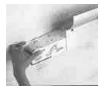
Rotating "sticky tape" cartridge installs and removes easily.

place for hooking up implement lights," says Roberts. "Most of the newer tractors are