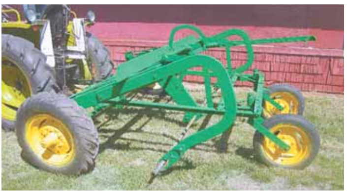
"Weeds really don't like this machine," says Darry Markle, who converted an old 10-ft. wide, Deere pull-type rod weeder to this 8-ft. wide, 2-pt. model.

"I had been using an 8-ft. wide, 3-pt. mounted field cultivator to control weeds in the shelterbelt, but it killed only about 70 percent of the weeds. My rod weeder pulls weeds completely out of the ground and then lays them back down so they haven't got a chance to grow back again. It results in close to a 100 percent kill. I still use the cultivator