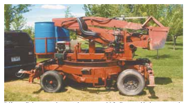
Self-propelled excavator is mounted on a powered 6-ft. dia. turntable that supports the boom. A pair of 55-gal. barrels on back are filled with water to serve as counterweights.