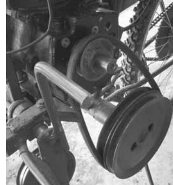
Glenn Sherwood built this motorized bicycle that's powered by an old 8 hp Tecumseh engine. It belt and chain-drives the bike's rear wheel.