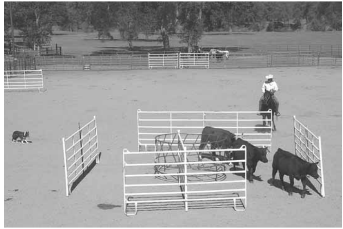
A new kind of cattle dog competition called "Rodearing" consists of the rider and dog riding and cutting out 3 to 5 cows.