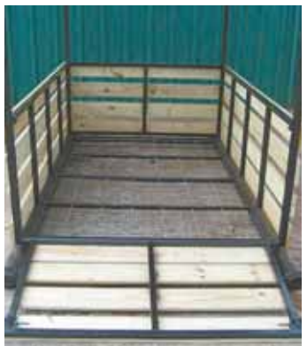
Hinged gate on front of feeder lowers to the ground, allowing Prewett to roll bales up the ramp by hand.

"I've used it for two years without losing any hay to mold at all," says Prewett. "I don't need a tractor to move the feeder around or even to load it. I just roll the bale up the ramp or drop it out the back of my pickup bed. The entire bale stays dry so my horses eat it all the way down to the floor. I also use it to feed small square bales. I stack 12 bales at