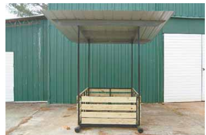
Portable covered bale feeder keeps bales dry, yet is light enough to be pulled by a 4-wheeler.

skids. I cut the front end of the skids at an angle so they'll slide over the ground without digging in.'