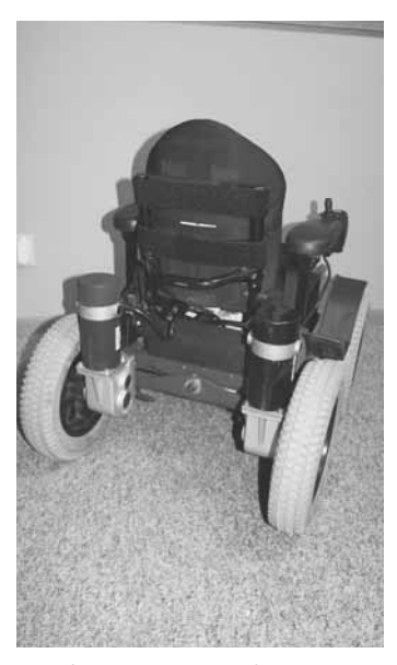
Sullivan bought 4 quality wheels off eBay and uses 4 motors to run them independently. To reduce weight, he made a compact aluminum frame just big enough to hold the motors and wheels.

Contact: FARM SHOW Followup, Jim Sullivan (ph 507 327-5361; jim@abilitychair.com; www.abilitychair.com).