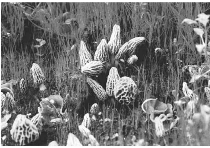
All you need to grow morel mushrooms is a 4 by 4-ft, space in your backyard and a $32.95 block of soil filled with mushroom spawn from Gourmet Mushrooms.