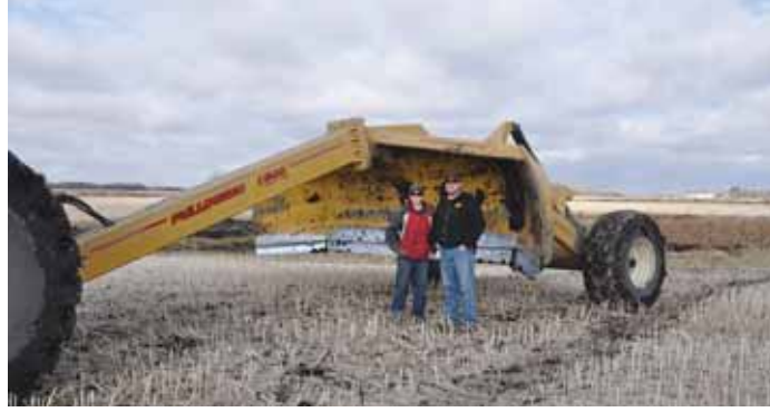
The Pulldozer works great for filling in potholes and leveling fields. It can also be tilted to dig new ditches or clean out existing ones.

The Pulldozer comes in four models. An 18-ft. model weighs 18,000 lbs., drags up to 18 cubic yards, and sells for $58,000. It requires a 250 to 375 hp tractor. The 24-ft. model weighs 24,000 lbs., drags up to 25 cubic yards, sells for $68,000 and requires