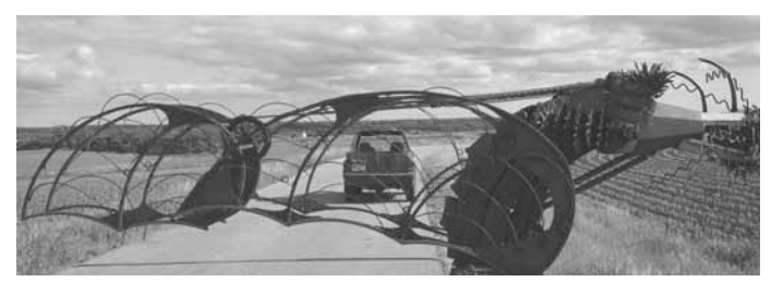
Dragon's wings are opened and closed by a solar-powered, motor-operated actuator. A keypad is used to operate gate.

Contact: FARM SHOW Followup, Paul Cassidy, 7384 Collegeview Rd., Eyota, Minn. 55934 (ph 507 254-0815; paulcassidy68@gmail.com).