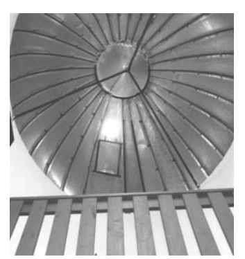
This view from top level looks straight up into silo roof.

Each level offers something different. The lowest level has a hot tub. The second has swings hanging from the ceiling, which Sue's daycare kids like to swing on. Made of chains