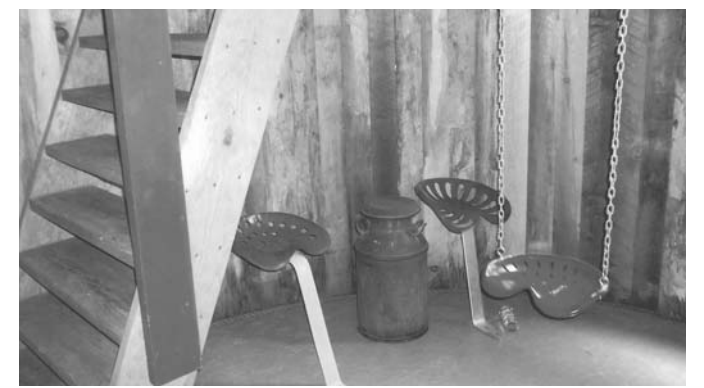
Because of the silo's small diameter, the 25-degree, ladder-like stairs between floors are very steep.

Contact: FARM SHOW Followup, Jim Dowling, 119 Springmont Drive, Hopkinsville, Ky. 42240 (ph 270 886-8735; jim.dowling@zerorest.net).