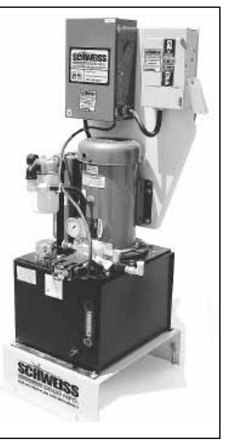
Self-contained hydraulic power unit can be floor or wall-mounted. It can also be mounted away from the door in a back room.

Visit Schweiss at www.bifold.com or call toll-free at 1-800-746-8273 .