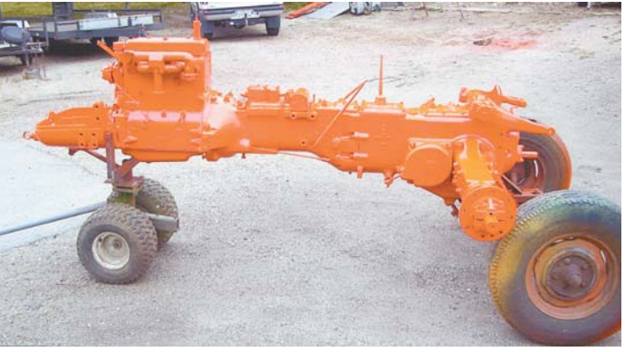
Bill Hinckley's home-built rolling stands make it easy to move tractor parts and frames whenever he needs to paint or sandblast. Photo shows a stand fitted with a Case tractor frame for doing restoration work.

with bead breaker, mount/dismount bars, etc. I take it with me on road trips where I almost always blow a tire or two. I welded a 2-in. sq. tube on the tire changer assembly that fits into my pickup's receiver hitch. I also welded an extra receiver tube on the tongue of my trailer, which allows me to change tires on the road without having to drop the trailer. It works great and has saved me a lot of money over the years."