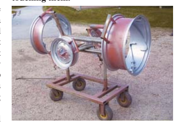
This rack was made to paint wheel rims. "It holds the wheel inside the rim so I can spin the rim around as needed to paint," says Hinckley.

for brackets to bolt to the rear axle. The front is tricycle wheels. I just revamp the brackets to fit different tractors."