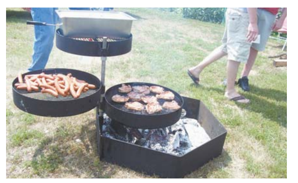
The Outdoor Chef multi-stage campfire makes it easy to vary cooking heat and style.

Contact: FARM SHOW Followup, CanCooker, Inc., 925 W 6th St., Fremont, Neb. 68025 (ph 402 964-2172; toll free 877 844-2772; info@cancooker.com; www.cancooker.com).