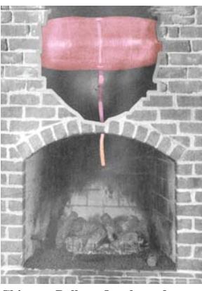
Chimney Balloon fits above damper inside chimney. Detachable inflation tube is used to inflate balloon until it's securely sealed against all sides of chimney.

Chimney Balloon LLC, 2123 N. Pontiac Drive, Janesville, Wis. 53545 (ph 608 467-0229; fax 206 984-4611; www. chimneyballoon.us/energy.html).