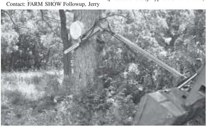
Tree trimmer has an 8-ft. mast and mounts directly to receiver on front-end loader.

Priebe, 6015 Tr. 219, Big Prairie, Ohio 44611 (ph 330 378-2960; jerrypriebe@hotmail.com).