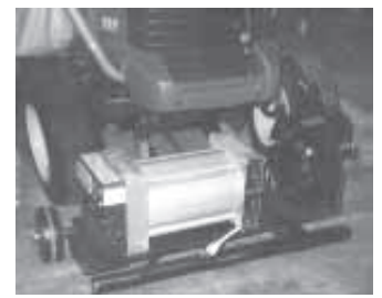
Riding mower's engine is used to belt-drive the generator, which delivers electricity through an electrical cord.

"It took me quite a while to get everything all figured out," says Schmitz. "The generator will take up to an 18 hp engine which is what my Deere riding mower has. When the generator is under load it'll produce up to 7,000 watts which provides enough electricity for an average house.'