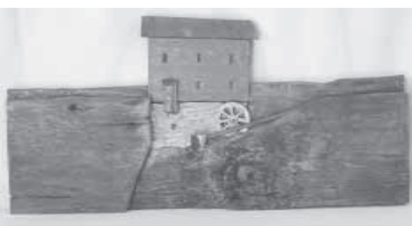
Dorrel Harrison's barn plaques are custom handcrafted to resemble a specific barn. They give people who love old barns a way to display and honor them.

Barn plaques start at $69/plus shipping,