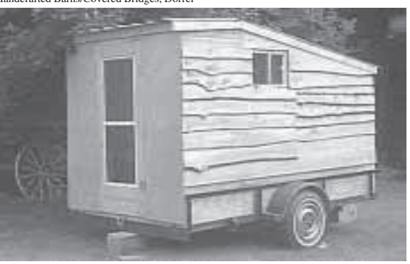
Art Howlett built this low-cost camper to slide into his utility trailer.

Contact: FARM SHOW Followup, Art Howlett, Box 152, Oriskany Falls, N.Y. 13425 (ph 315 821-7922; arffer 1@juno. com).