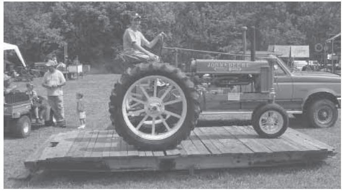
Teeter-totter allows drivers of all skills to drive their tractors onto a platform set on a center beam that runs from side to side. The goal is to balance the tractor as quickly as