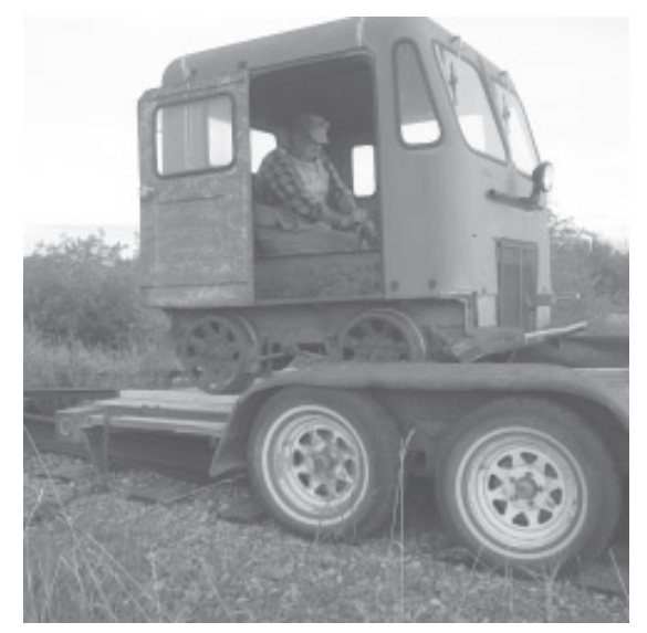
Gas-powered rail cars, originally designed to transport work crews, are fun to drive on abandoned rail lines, say hobbyists.