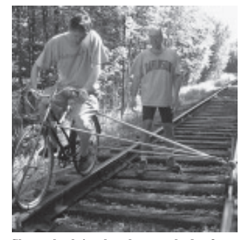
Skate wheels in a bracket attached to front wheel run against each side of rail, holding the bike in place.

Contact: FARM SHOW Followup, Richard Bentley, Mount Arab, P.O. Box 786, Tupper Lake, N.Y. 12986 (ph 518 359-9300; http://rrbike.freeservers.com; Bentley@northnet.org).