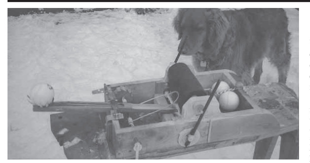
Nylon line wraps tightly around lower end of catapult arm. Then arm is cranked down under door hinge trigger, ready to toss ball up to 70 ft.