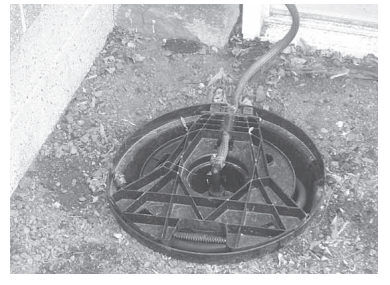
tor, recommends putting 2 Cylinder lid extends just above ground level.

to 3 in. of gravel at the bottom so the hose can drain through holes in the bottom of the container. The lid extends just above ground level "It's nice having the hose so close to the outside faucet and keeping it out of