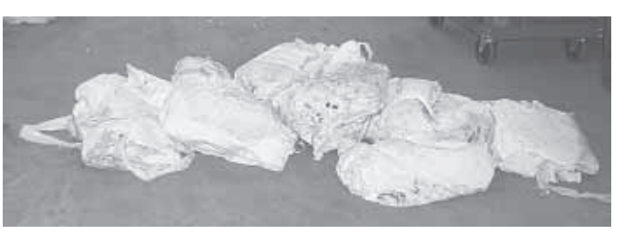
Waste plastic from silage bags is turned into plastic lumber called "Baleboard".

Contact: FARM SHOW Followup, Ben Hoffman, 103 Storer Rd., Bradford, Maine 327-1064; 04410 (ph 207 bennmeh@earthlink.net).