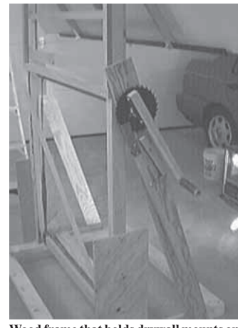
Wood frame that holds drywall mounts on two wooden uprights that slide up or down inside wooden guides.

Contact: FARM SHOW Followup, Tom Reitsma, 7 Wales Road, Stafford Springs, Ct. 06076 (ph 860 565-3054; walstibn@cox.net).