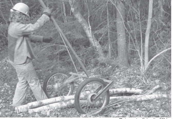
Tipping the sulky back lowers the frame to the log, which is then chained in place.