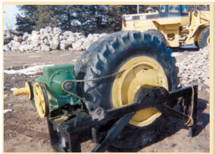
Prototype machine tumbles rocks inside a 25-in. tire. Inventor Don Emme sealed off the open sides of tire with steel plate. Since photo was taken he's put guards over chains.