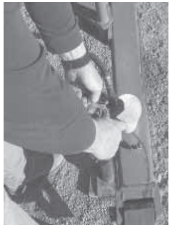
Tool works like pliers to grip the valve end. Turn a simple tap on one side of the pliers and it releases pressure as needed. "It works so smoothly you can release fluid into a Dixie cup," says George Waite. "You don't have to try to unscrew the hose or force the coupler."