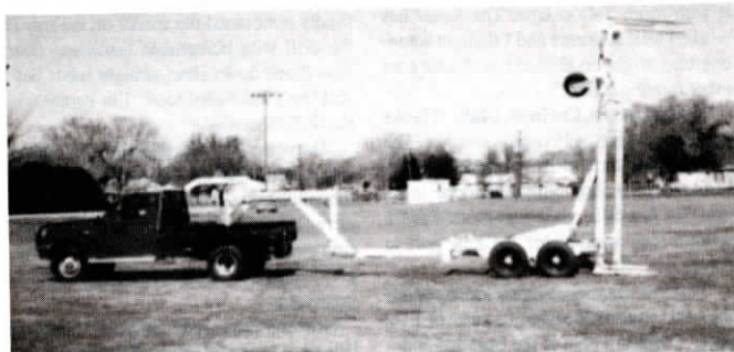
Flatbed hauler unloads bales either in a line by tilting the bed upward and sliding them off, or it raises up to a 90° angle to unload them in a stack.

For more information, contact: FARM SHOW Followup, Wilson Mfg., Inc., P.O. Box 285, Cherokee, Okla. 73728 (ph 405 596-3381).