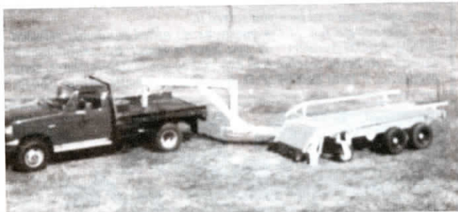
Bale trailer swings out to right or left in field to pick up bales and swings back behind tractor or pickup for transport.

Contact: FARM SHOW Followup, Thurston Mfg. Co., Hwy. 87A, Box 218, Thurston, Neb. 68062 (ph 402 385-3041).