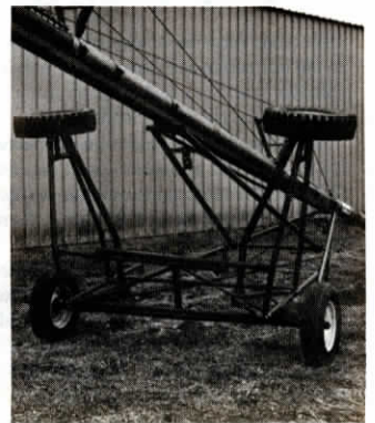
Optional outrigger is recommended for larger augers commonly used on uneven terrain.

For more information, contact: FARM SHOW Followup, Luff Land Industries, Box 228, First and Mitchell Streets, Bates City, Mo. 64011 (ph 816 625-4022).