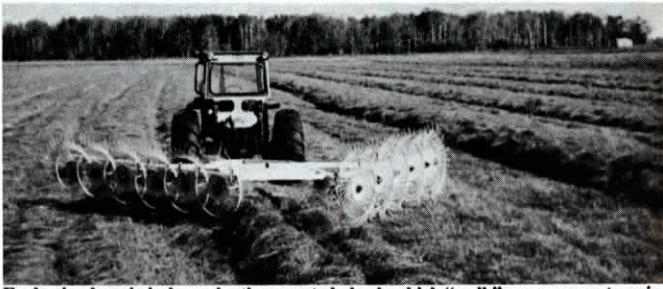
Each wing has six independently mounted wheels which "walk" over uneven terrain, obstacles.

GOES FROM A 24-FT. WIDTH IN THE FIELD TO 8 FT. ON THE ROAD