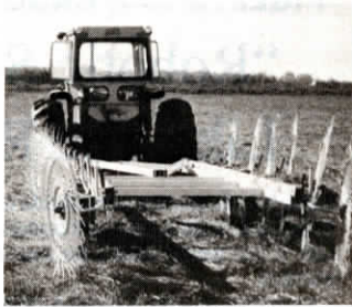
Kuehn rake folds to 8 ft. for transport down the road at 45 mph.

The Kuehn rake is fitted with 16-in. tires