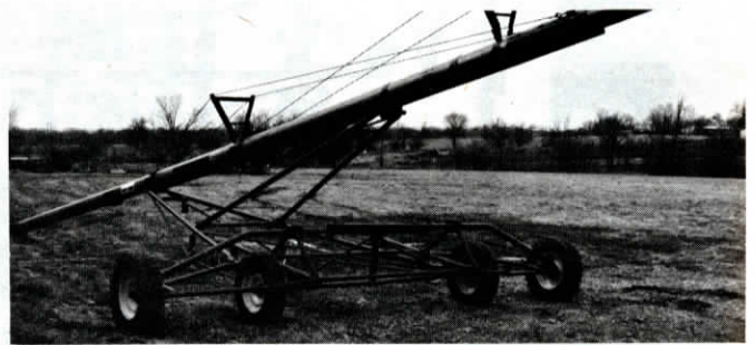
Each 4-ft. wing is folded in or out manually.

For more information, contact: FARM SHOW Followup, Mel Kuehn, Kuehn & Kompany, Rt. 3, Box 272, Aitkin, Minn. 56431 (ph 218 927-3260).