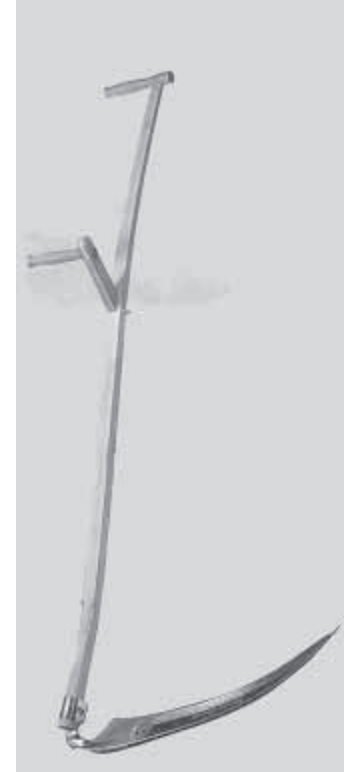
European-style scythe is lightweight and well balanced, making it easier to use and mor e efficient than American-style scythes, says a Maine company that recently began importing them.

blade, sharpening stone and holder, peening jig for maintaining the blade edge, and a book about scythe use, sells for about the same price as a low to medium priced push power mower.