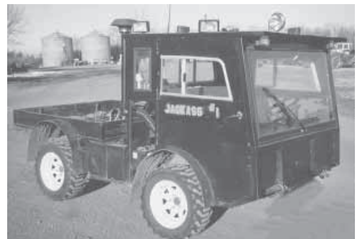
One-of-a-kind, home-built 4-wheeler is built low to the ground.