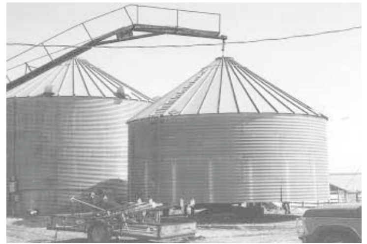
Pull-type boom is shown lifting top half of 10,000-bu. bin that Van Boening moved to another location.