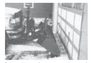
Lets you get up close to garage doors and walls to drag snow away.

"It lets you get in close and drag snow away, then reverse the blade to push it off," says Mark Miller. "Because you're pulling snow, you never have to turn the pickup around in order to 'back drag'. The blade can be equipped with clip-on box ends to trap snow, decreasing spillage and increasing re-