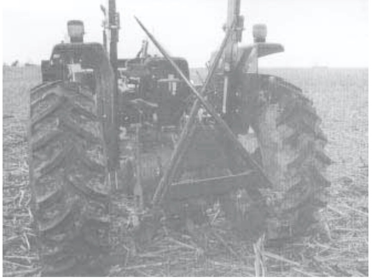
Double spears fold up out of the way, leaving drawbar accessible .

Contact: FARM SHOW Followup, Hiniker Co., Airport Road, Box 3407, Mankato, Minn. 56002 (ph 507 625-6621; fax 5883; Website: www.hiniker.com).