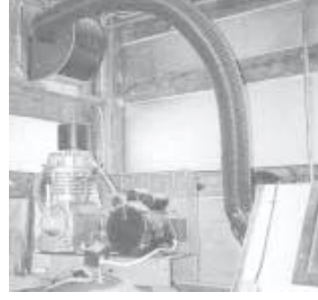
To suck dust out of cabinet, he closed off both sides of an old furnace blower and mounted it on the shop wall above sand blaster.