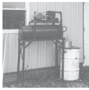
Vacuum pump outside shop sucks oil from vehicles inside.

"I screwed a piece of plywood onto one side of the grill which I use to hold oil jugs. When I drain oil from my combine, I hang a 5-liter plastic jug from a hook that's attached