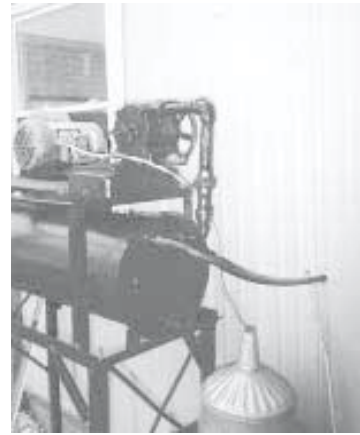
Suction hose from tank runs through hole in shop wall.

longer commonly used by dairies because most dairy operations now run more than three milkers. As a result you can buy them cheap."