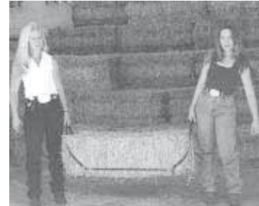
A bale carrier is also available for handling two small square bales at a time.

Fields makes and sells the straps. One model adjusts to fit everything from a single sheet of plywood up to a 15-in. thick pillow top mattress. Sells for $19.95. Another model is designed strictly for mattresses up to 12 in. thick. It sells for $14.95.