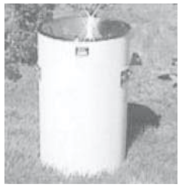
Water bowl rests in the top of 12-in. dia. PVC pipe that's set in the ground.

Frank also devised a simple feeder. "It's a 6-in. pvc pipe, cut in half, with the ends closed up," he explains. "It hangs above the mangers on a sliding bracket. We can fill it from outside the pens and then slide it in so the animals in that area are all fed at once. This keeps them from fighting over feed,"