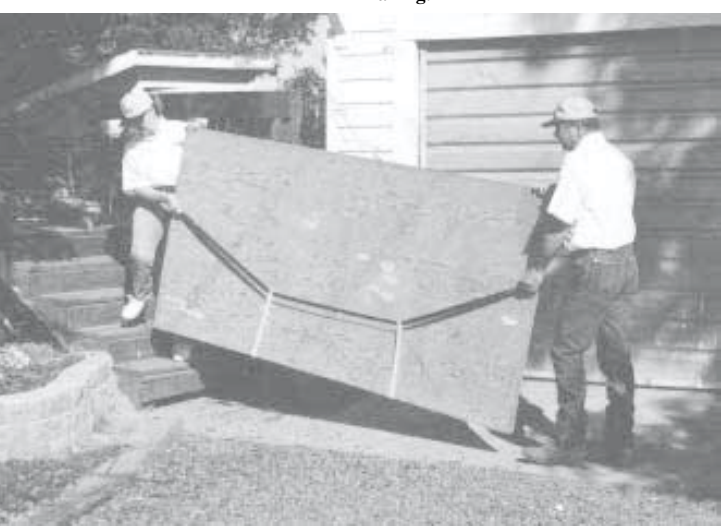
Strap is ideal for hauling plywood, sheetrock, and even large mattresses.