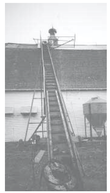
Elevator has a 12 by 4-ft. safety fence at the top, providing a safe area where Meister can sit or stand without fear of falling.

Contact: FARM SHOW Followup, Mel Meister, 1241 D Road, West Point, Neb. 68788 (ph 402 372-2680; E-mail: dm85921@navix.net).