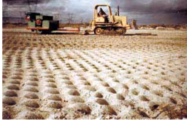
Land imprinter seeder makes a checkerboard pattern of little ponds all across the field. The ponds catch and hold water and help keep soil moist around seeds.