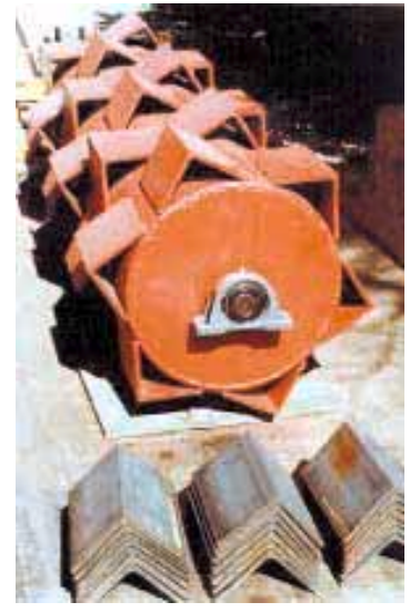
L-shaped steel brackets weld onto steel cylinder to make indentations in seedbed.

He sees it as being useful in rangeland/ pasture restoration or forage crop establishment. "Advantages over other methods include better soil and water conservation, better stands of vegetation, faster growing seedlings, and greater production of forage/plant material. It can operate in rough terrain with