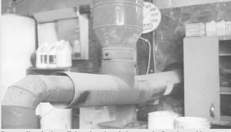
Dunton slipped a large T-shaped section of pipe over the flue pipe on his stove. An aeration fan pulls heated air off the flue pipe and circulates it around his shop.

ft. wide New Idea mower. I use the mower to clear pasture land on which I've already cut down all the trees. I measured the highest stumps in the pasture and then made brackets for the skids accordingly, so the mower