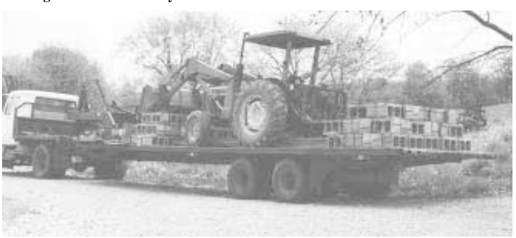
With rack removed the flatbed trailer can be used to haul conventional loads.