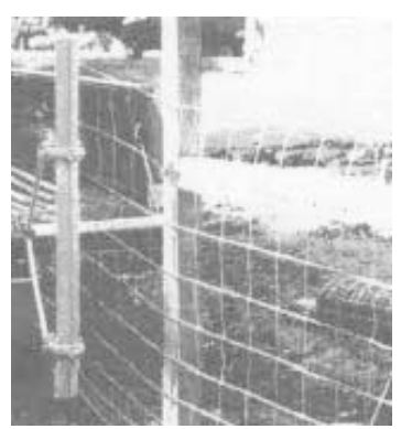
An A-shaped puller is chained to a pickup, tractor or come-along to stretch the fence.

Suitable for any size woven wire from 32 to 49 in. Can be factory-adapted for game fence wire too.