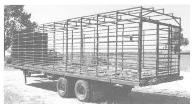
Rack will hold 18 to 20 head. When not in use for hauling cattle, rack is simply stored on the ground out of the way.

Contact: FARM SHOW Followup, Foxworthy Supply, 4650 20 Mile Road, Kent City, Mich. 49330 (ph 800 632-1423 or 616 675-7584; fax 7601).