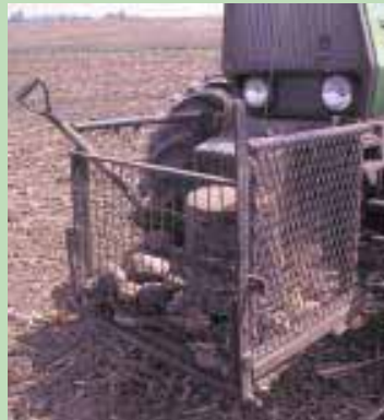
Tippling rock box was made from heavy-gauge woven metal off a farrowing crate.

Obrecht also made a rock box for his Deere 4630 tractor. It's 6 ft. long and 2 ft. wide and is mounted under the frame of the tractor, extending out both sides. The frame was made from an old front mount Deere cultivator and the 8-in. high sides are made from woven hog panel. The bottom is made from corn crib wire. A pair of hangers off the field cultivator are used to secure each side of the