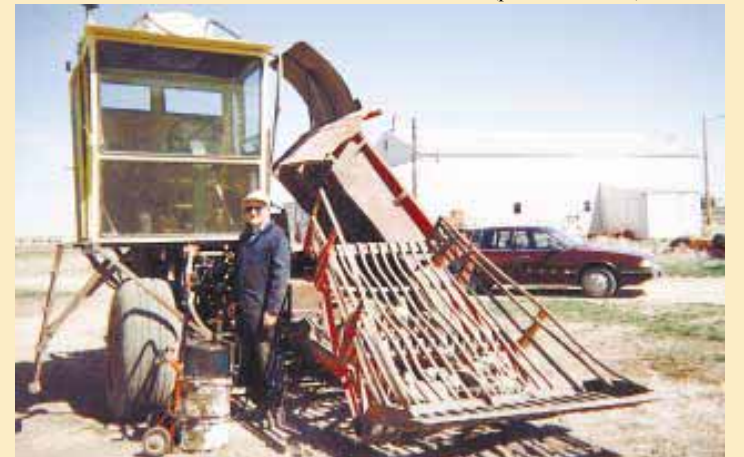
Weimerskirch runs the front edge of the bucket just under the ground surface to scoop up rocks. Dirt falls out as the bucket is tilted back.

Contact: FARM SHOW Followup, Eugene Weimerskirch, 11031 SR 17N, Coulee City, Wash. 99115 (ph 509 632-5525).