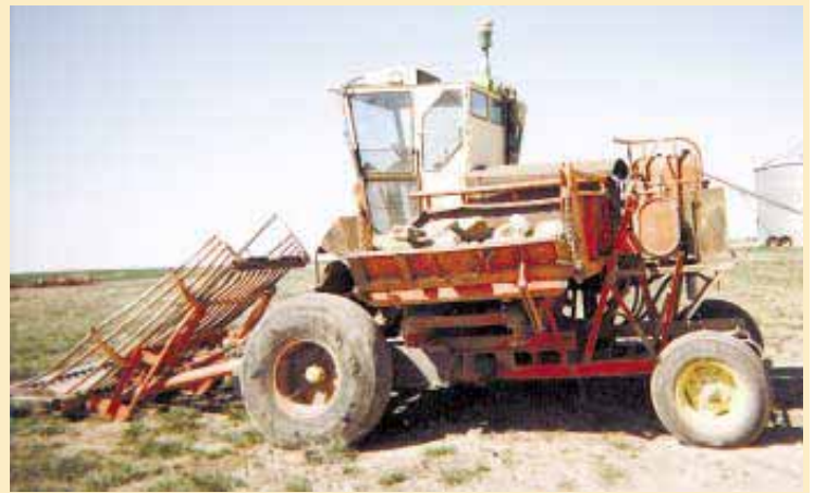
Rock-picking bucket mounts on the chassis of a Case self-propelled combine.

"IT WORKS FAST AND I HAVE A GREAT VIEW IN FRONT OF ME"