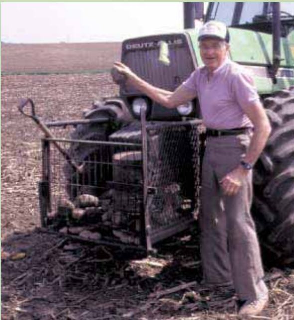
Trip handle dumps rocks out the bottom of front-mount rock box.