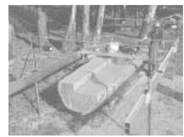
Mill can be set up anywhere, even in the woods so logs can be sawn where they lay.

It's powered by a Kawasaki 8 hp engine and features a 20-in. dia. saw blade that re-