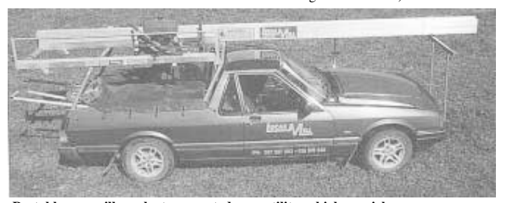
\label{portable saw mill can be transported on a utility vehicle or pickup. \\