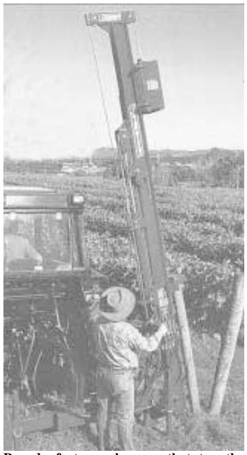
Pounder features a hammer that stops the instant you take your hand off the hydraulic lever.

Contact: FARM SHOW Followup, Fairbrother Industries Ltd., 9 Bay Park Place, Beachhaven, Auckland, New Zealand (ph 011 64 9 482-0866; fax 0877; E-mail: sales@fairbrother.co.nz). In North America, contact: D&D Farm & Ranch Supplies, 516 H1-10E, P.O. Box 1329, Seguin, Texas 78156-1329 (ph 830 379-7340; fax 372-4514).