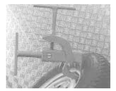
Tool works with two hand cranks that force the bead off the rim.

Contact: FARM SHOW Followup, Spaldings Ltd., Sadler Road, Lincoln, England LN6 3XJ (ph 011 44 1522 500600; fax 500173).