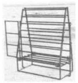
By flipping up the two sides and pinning them into place you can haul the unit away in your pickup.

"It provides easy access to calving pastures and to pens or any other fenced-in area," says the company. "It's especially useful for people who have difficulty standing or dismounting from an ATV. You can haul the guard and your ATV in a pickup, then unload them and use the ATV to check on cattle. The unit is light enough to be portable so it can easily be moved to a different location if desired."