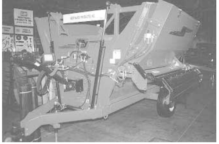
The two-wheeled, pto-driven "Jiffy" bale shredder is designed to load itself with one bale and carry another one. An optional grain feeder can be mounted on one side.

The optional grain feeder sells for $1,376. Contact: FARM SHOW Followup, Dick Hauser, Neptune Enterprises, 31877 Dog Hollow Rd., Richland Center, Wis. 53581 (ph 800 272-7547 or 608 585-4808) or Scott Waldie, Westward Products, Airport Road, 1312 21st Ave. N.E., Box 2062, Jamestown, N. Dak. 58402 (ph 701 251-2182; fax 1 800 682-2359).