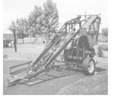
Unit is also available as a hydraulicallyoperated model on wheels that automatically lays down a Zimmie stack.