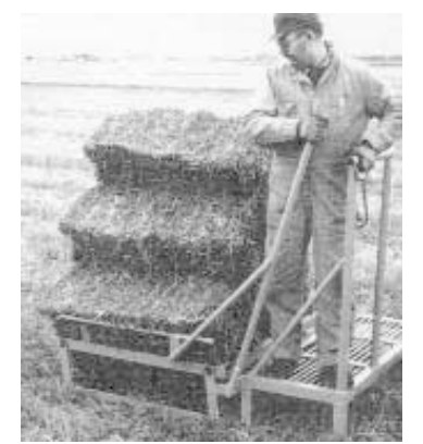
On the manual stacking unit, a person rides along on the unit to stack the bales and release them onto the ground.

Contact: FARM SHOW Followup, Larry Zimmerman, Zimmie-Stacker, 1156 180th Ave., New Richmond, Wis. 54017 (ph 800 759-7033 or 715 246-4890; Web Site: http:/ /members.aol.com/zstack/main.html